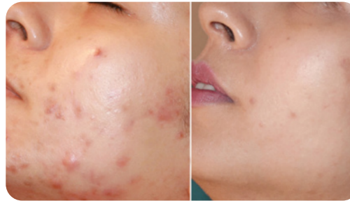
Results after 4 treatments