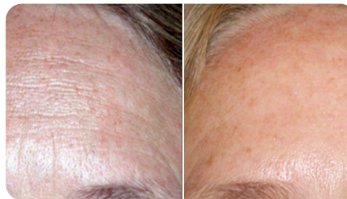
Results after 5 treatments