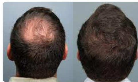
Results after 10 treatments